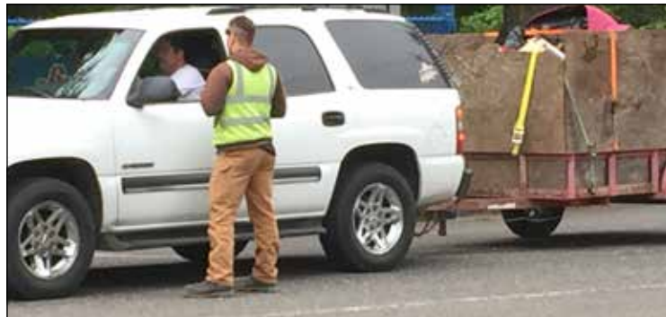
The May 16 Bulky Waste Day event has been postponed, to be held at a later date.

Bulky Waste Day Postponed Republic Services