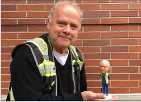
Inspectors Ditty & Bitty highlight Building Safety Month.

Learn more about building safety and permitting,