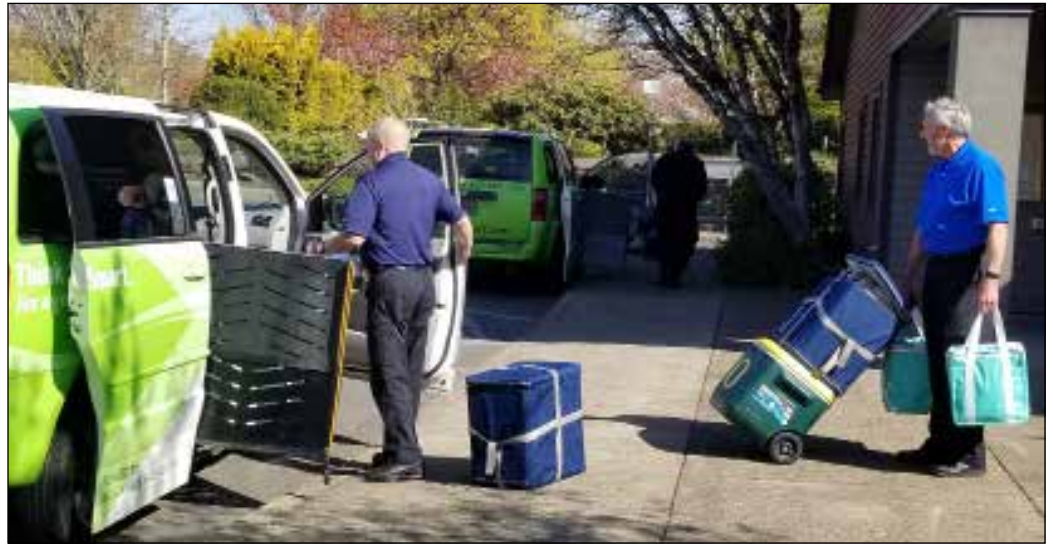
SMART drivers pick up meals at the Wilsonville Community Center to deliver to older adults receiving Home Delivered Meals.

This capability is allowing additional public meetings to resume, including the Planning Commission and the Development Review Board. Zoom has also been instrumental in allowing the City to conduct daily Emergency Management meetings and other critical meetings.