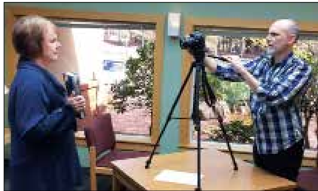
Library staff records a “Great Books!” book review for the City’s YouTube channel.

The Library is using YouTube to post book reviews and “Stories on the Go,” a virtual version of the popular “StoryTime” performances. Additionally, Library staff are helping to educate patrons about the availability of virtual services, including downloadable e-reader and audiobook titles. To learn more about the Library’s virtual collection, visit wilsonvillelibrary.org/virtualuse .