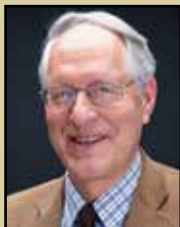
Tim Knapp Mayor

The City Council usually convenes on the first and third Monday of the month at City Hall, with work session generally starting at 5 pm and meeting at 7 pm. Meetings are broadcast live on Comcast/Xfinity Ch. 30 and Frontier Ch. 32 and are replayed periodically. Meetings are also available to stream live or on demand at ci.wilsonville.or.us/WilsonvilleTV . Public comment is welcome at City Council meetings.