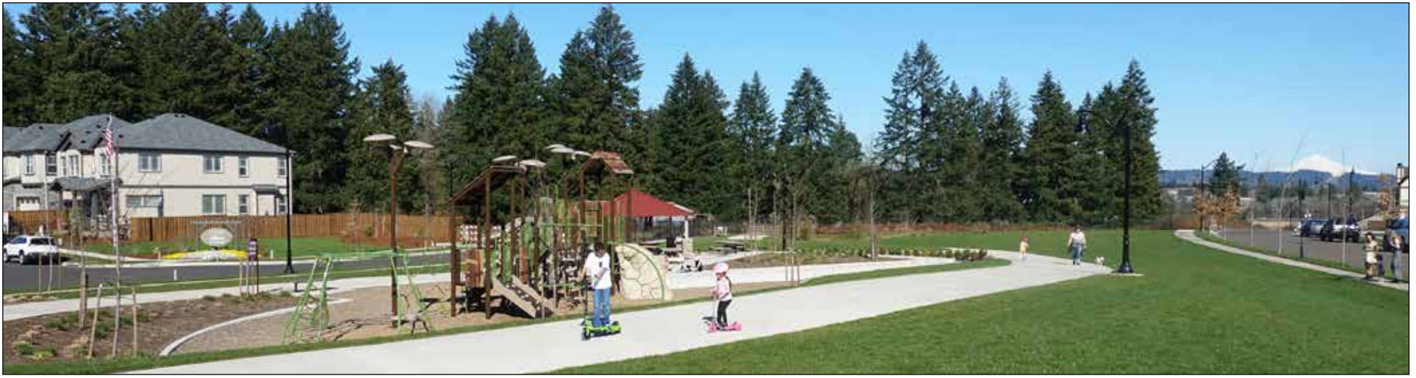
Trocadero Park in Villebois provides a view of Mount Hood among other amenities, including a play area, park shelter and skate park. The park is getting a new tennis court during an upcoming project to complete the remaining 18 acres of the community’s 33-acre linear park along the regional Ice Age Tonquin Trail.