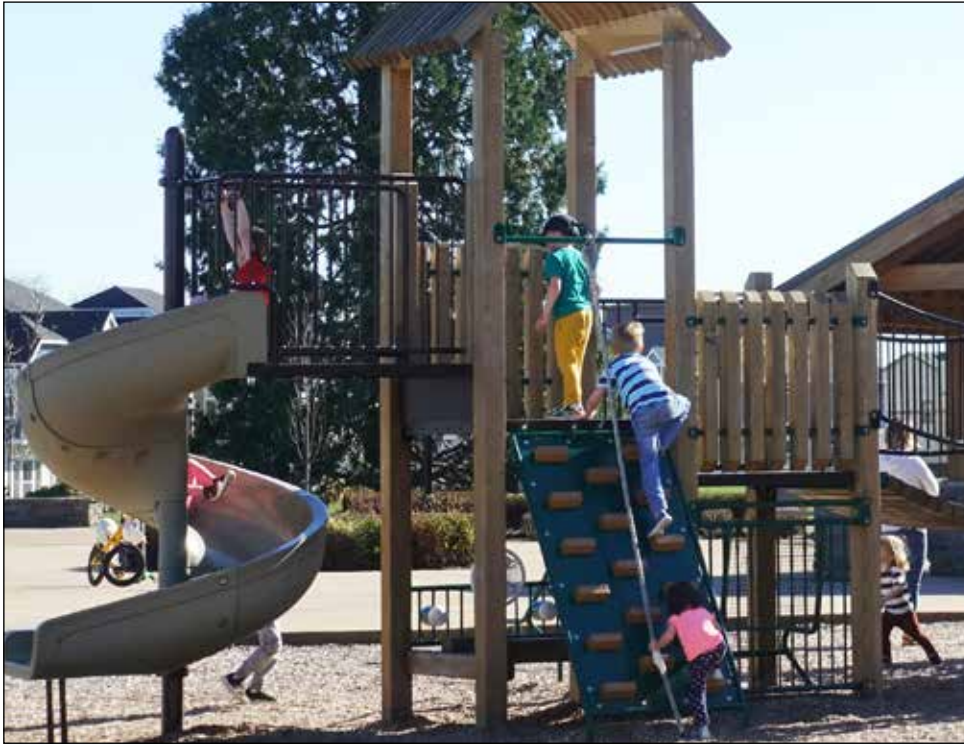
Edelweiss Park in Villebois is one of five completed parks along the Villebois Greenway. Three new parks are about to be constructed, more than doubling the size of the greenway and providing new amenities.

At the Village Center, the City’s economic development staff is working to incentivize mixed-use development by considering a Vertical Housing Develop-