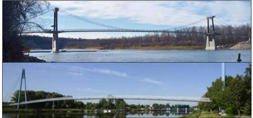
Community members are invited to weigh in with their preference for a suspension bridge (top) or cable stay bridge (bottom). The two bridge types were recommended by the French Prairie Bridge Task Force and City Council for further consideration.

French Prairie Bridge Survey Available April 17-May 5 FrenchPrairieBridgeProject.org