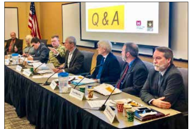
Watch the Willamette River basin watershed presentation online: youtube.com/watch?v=ZSEvTSiOW0

In February, the City of Wilsonville hosted Congressman Kurt Schrader on behalf of the Oregon Congressional Delegation for a presentation on issues pertaining to the Willamette River basin watershed.