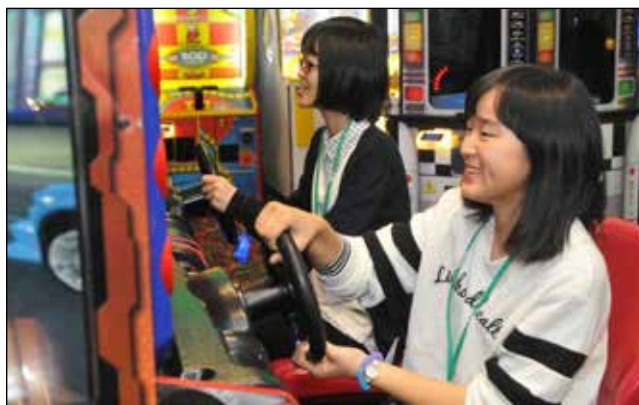
Teens from Kitakata, Japan, enjoy a previous visit to Wilsonville. The visits are supported by local families who host visiting students for 10 days.

Organizations or individuals may also assist by planning daily excursions, sponsoring a group activity,