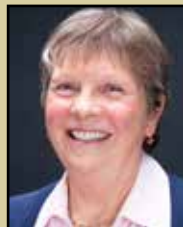
Susie Stevens City Councilor