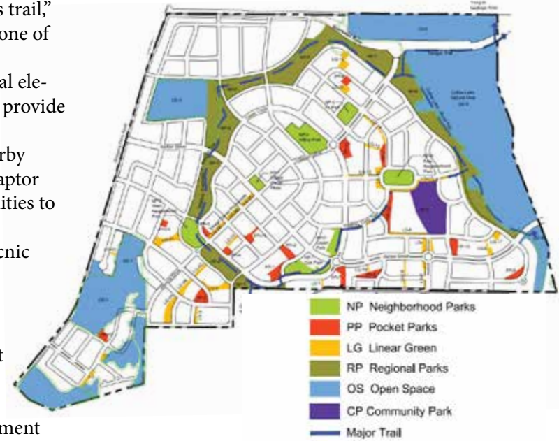
The olive green color illustrates the placement of the Villebois Greenway, a 33-acre linear park and trail system.

Park 6 features a fenced dog park, with a covered