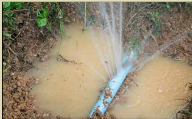
Spring has sprung. Has a leak? The City recommends that residents inspect irrigation systems before regular use. Early detection can lower water usage charges.

For information on billing, meters, rates, payment options and leak detection, visit ci.wilsonville.or.us/UtilityPayment or call 503-570-1610.