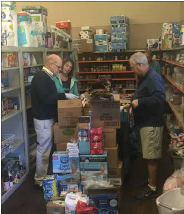
The $5.4 million that Wilsonville is receiving from the federal America Rescue Plan Act could provide additional support for Wilsonville Community Sharing, operators of the City's food bank.

Among the programs being earmarked for the Council's consideration: a mental health specialist to support Wilsonville Police Department response, additional support for economic development, eviction assistance, enhanced support for Wilsonville Community Sharing's food bank and utility bill assistance programs, investment in programs to advance affordable housing, enhancing the City's fiber-optic network, ADA upgrades for numerous city parks, and increased funding for City janitorial services for parks and city facilities.