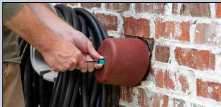
Covering exposed hose bibbs is one easy way to reduce your chance of suffering a burst water pipe.

Checking your water meter can be an effective way