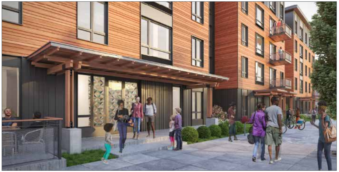
The Songbird Apartments in North Portland are one recent example of an equitable housing development that combines residential units and ground floor spaces for gathering and public use in close proximity to transit service.

A lot must happen before ground is broken. Leland Consulting Group is preparing a Request for Qualifications (RFQ) that the City will send to builders in the affordable housing and transit-oriented development community. After selecting a short list of two or