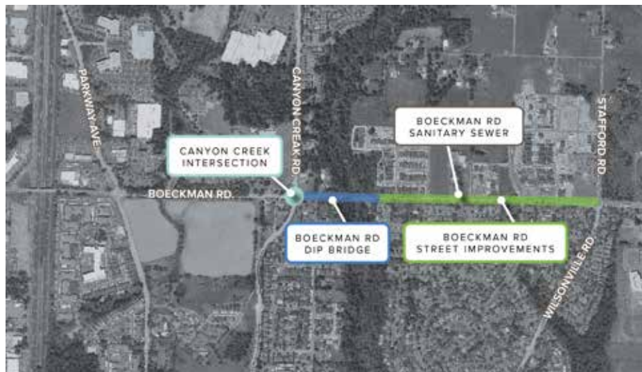
An upcoming suite of projects on Boeckman Rd. will address the "Boeckman Dip" to yield a safer roadway and support the growth of Frog Pond neighborhoods.

To complete these improvements more efficiently