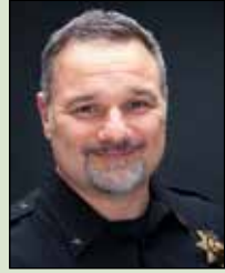
Police Chief Rob Wurpes

Recently, I was driving home after dark. As I turned onto a side street to enter my neighborhood, I noticed a pedestrian entering the roadway to cross. This person was dressed in dark clothing; I didn't see them until the last minute. Fortunately, I was able to stop in time.