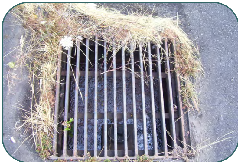
Poorly maintained catch basin