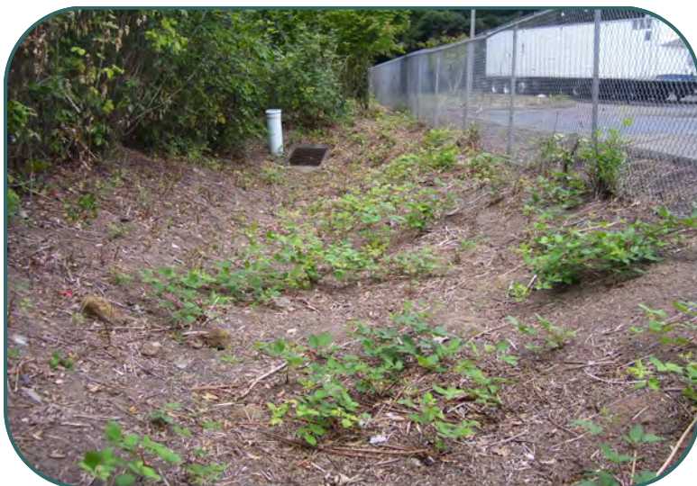
Poorly maintained swale