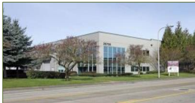
26755 SW 95th Ave URD

By 2014, three of the TIF Zones had been leased or purchased by businesses who would not benefit from the TIF Zone program within the program’s time frame. Consequently, the City Council eliminated these three TIF Zones in the fall of 2014, leaving the three remaining TIF Zones. These three TIF zones are set to expire November 4, 2018.