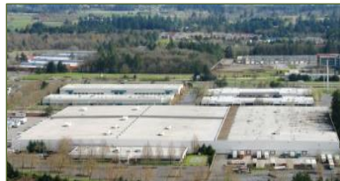
27255 SW 95th Ave URD