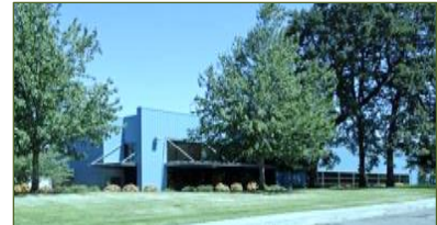
26440 SW Parkway Ave URD