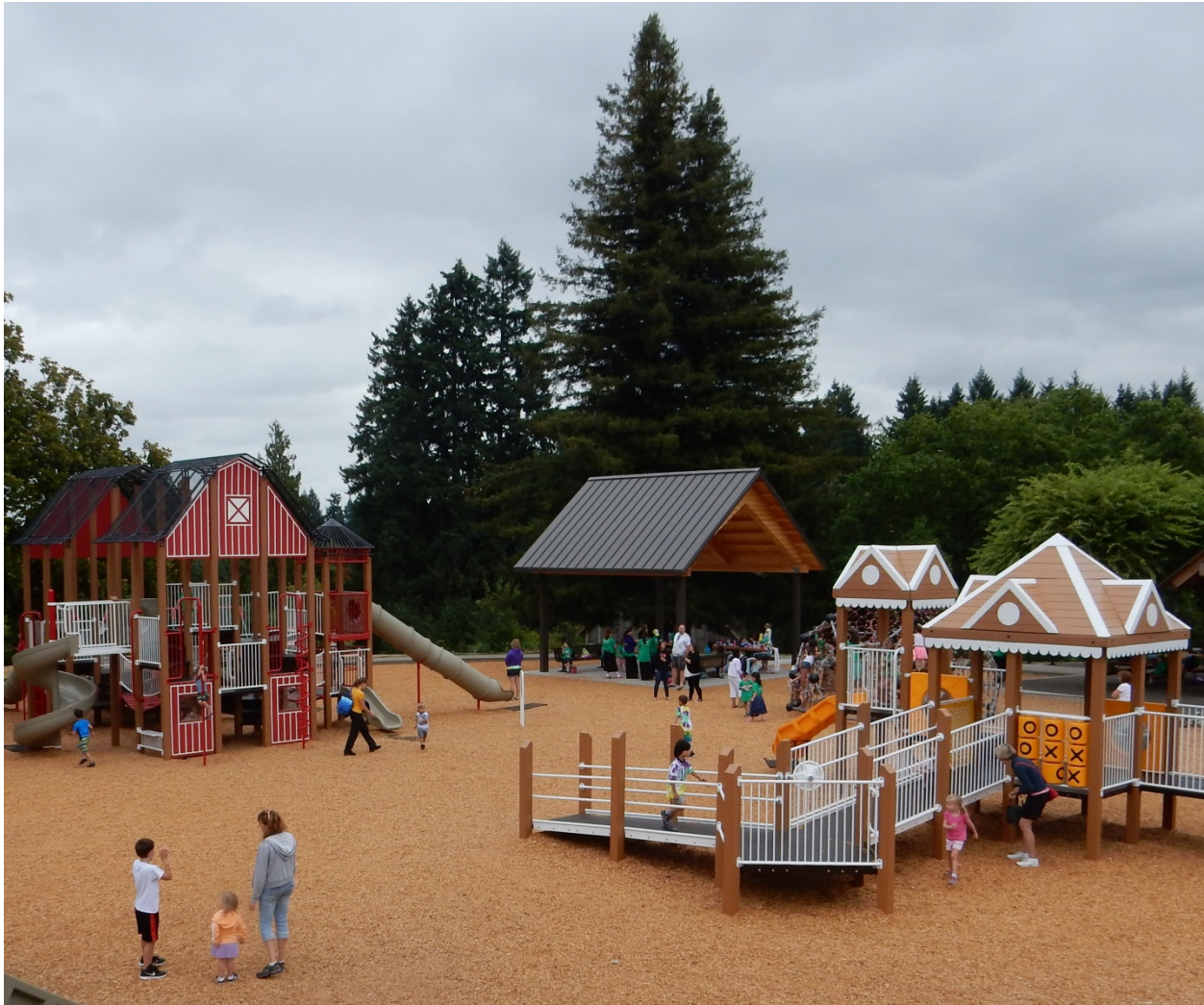
One example of a project within the Year 2000 Plan area includes the completion of the Murase Playground Retrofit, pictured above. This project included the design and construction of two new play structures as well as a 24-foot-long embankment slide.