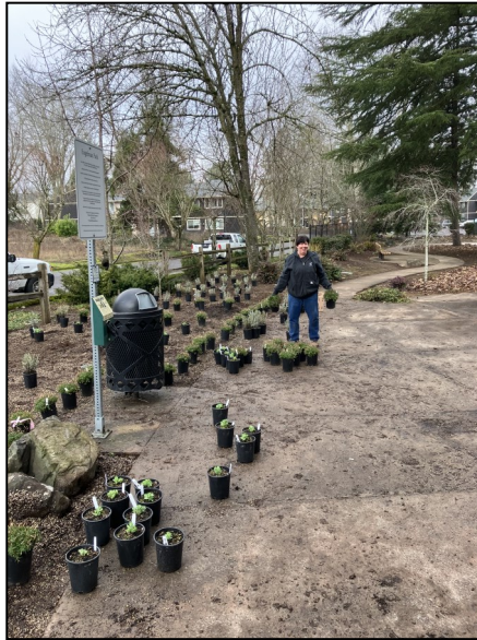
Installing the new plants.

The team undertook a landscape overhaul in a section of Engelman Park in February. The landscape area was slowly aging out and being overrun by blackberries. The team prioritized a beautiful display that consists mostly of native plants that are drought tolerant.