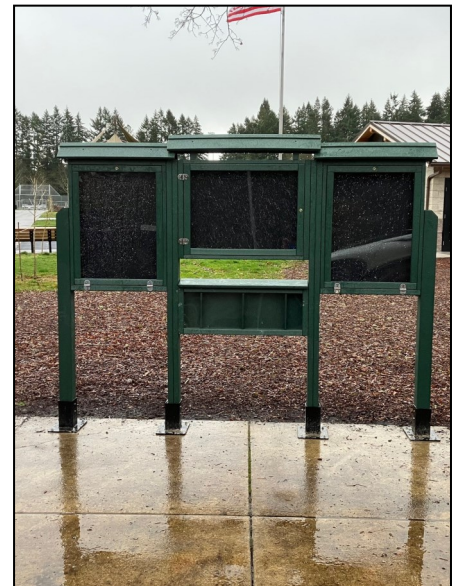
Newly installed bulletin board.