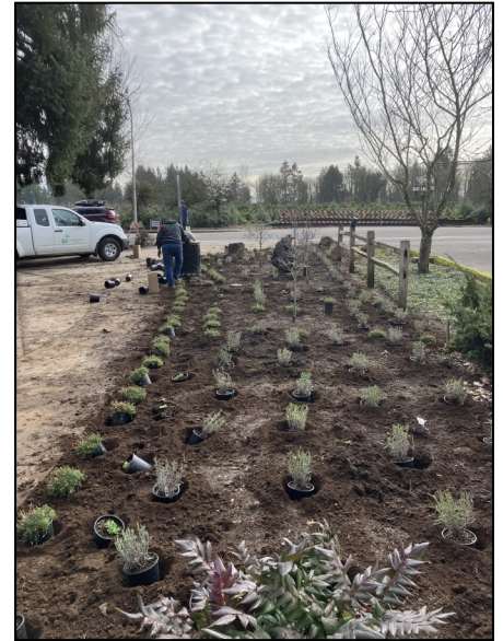
Planting project nearly complete.