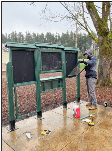
Finishing up installation.

Memorial Park has a new space for the team and community groups to post information. The bulletin boards, installed near the main parking lot in Memorial Park, will give user groups and community members a centralized location for information about Memorial Park usage.