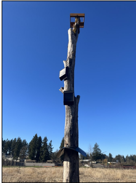
Raptor habitat snag.