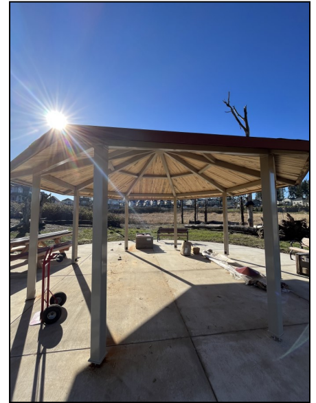
New finished shelter in RP 7.