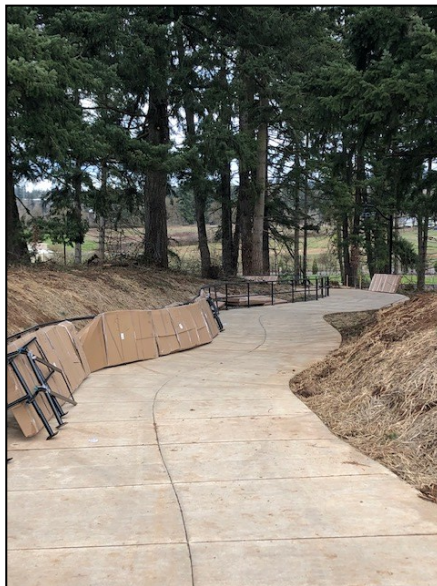
ADA railing being installed.

Projected Completion—Early 2023. Landscaping nearing completion.