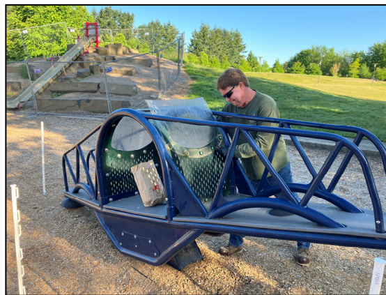
Playground repair at Murase.