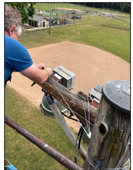
Athletic field light safety.