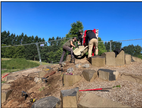
Murase slide replacement.

There is no surer sign of summer than the water features being turned on. The team has been hard at work keeping up with the fantastic water feature usage. June also brings a lot of prep work for athletic tournaments, camps, and the 4th of July. The team has spent time addressing playground concerns that arose, including one with the beloved Murase slide. Through quick response and action the team expects to have the slide repair completed soon. Summer is here, the community is excited, and the team is ready.