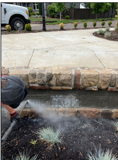
Prepping art install at Tivoli Park.