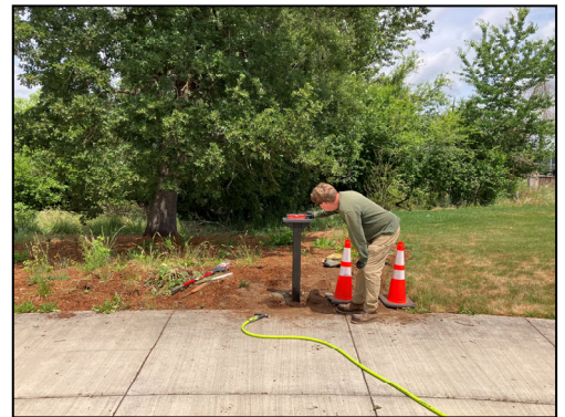
Little Free Library install.