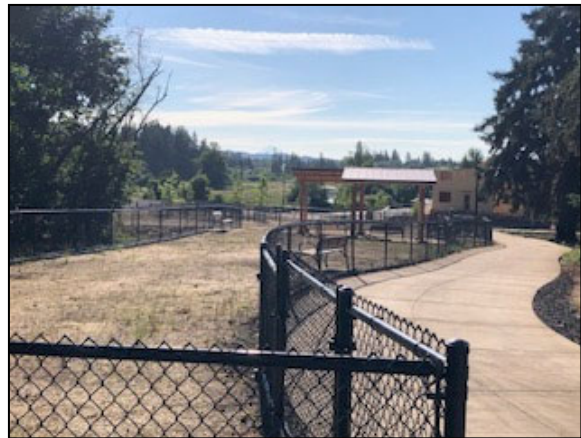
Dog park waiting on rain to help the grass grow.