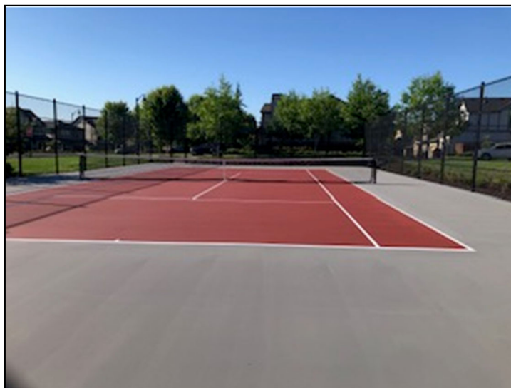
Completed tennis court.