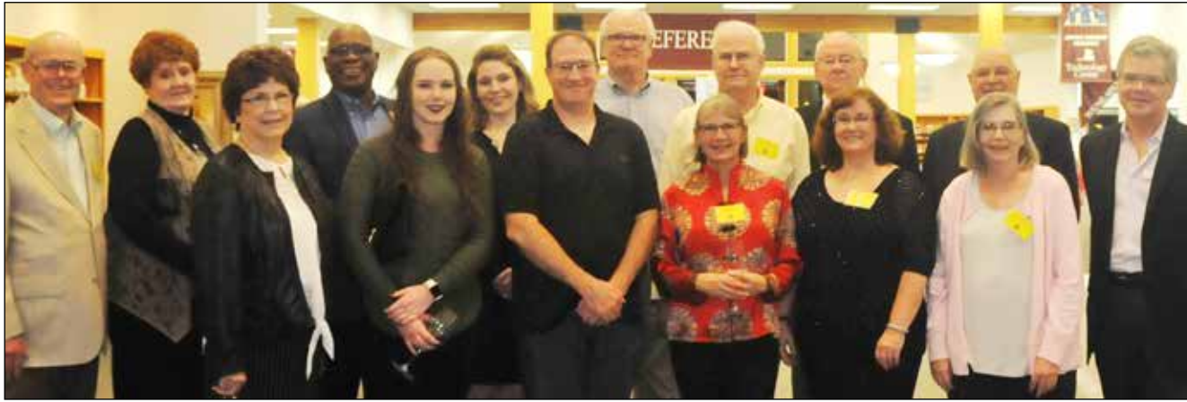
Members and supporters of the Wilsonville Library Foundation gather at the organization's annual fundraiser in October where representatives of the Xerox Community Involvement Program donated $15,500 to local programs.