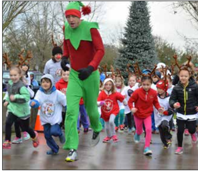
Hundreds of people each year, including these kids and elf, participate in the annual Reindeer Romp 5k and Kids Dash.

online at WilsonvilleParksandRec.com or the day of the event.