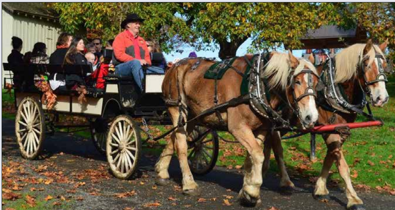
In October hundreds of people attended the Fall Harvest Festival and many enjoyed horse-drawn wagon rides.