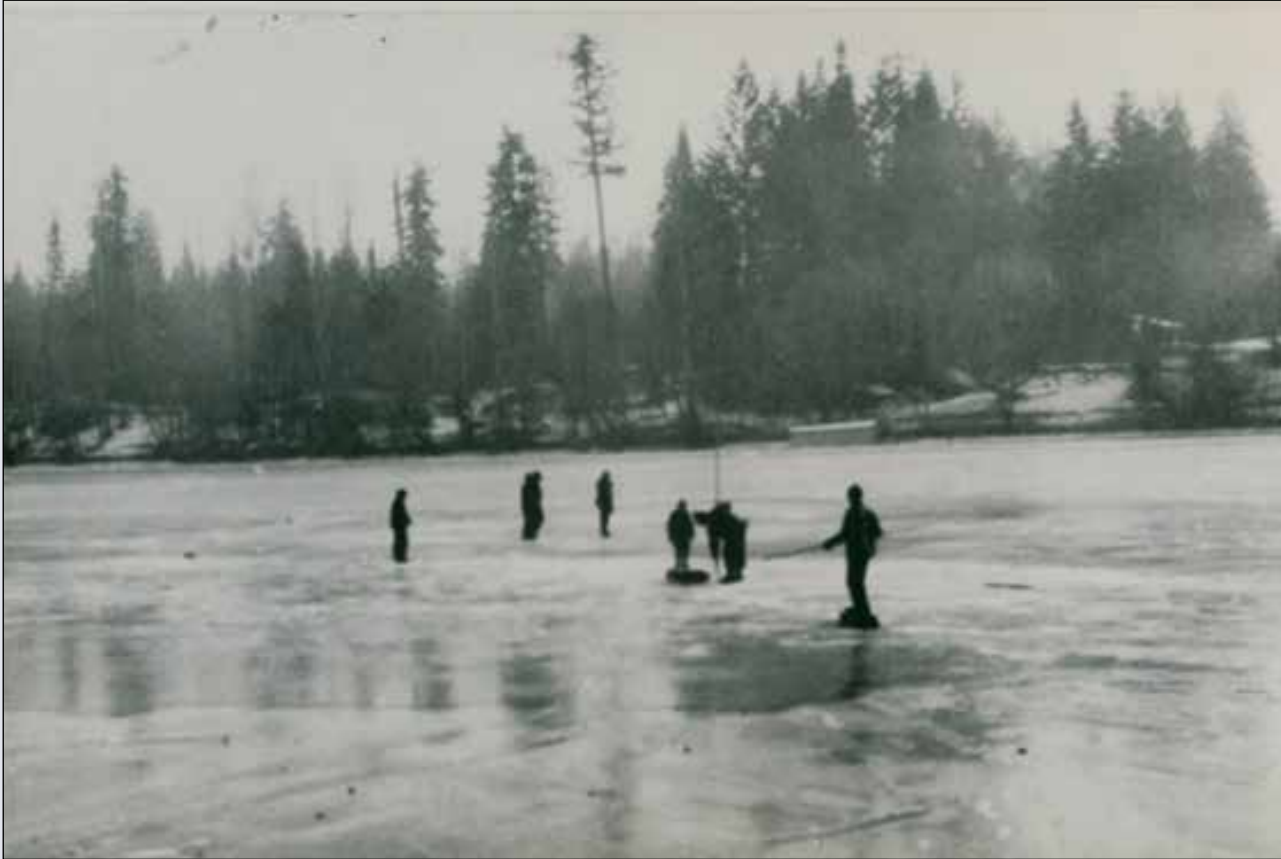
This Boones Ferry Historical Society photo, taken on Christmas Day in 1924 shows ice-skaters on the Willamette River.