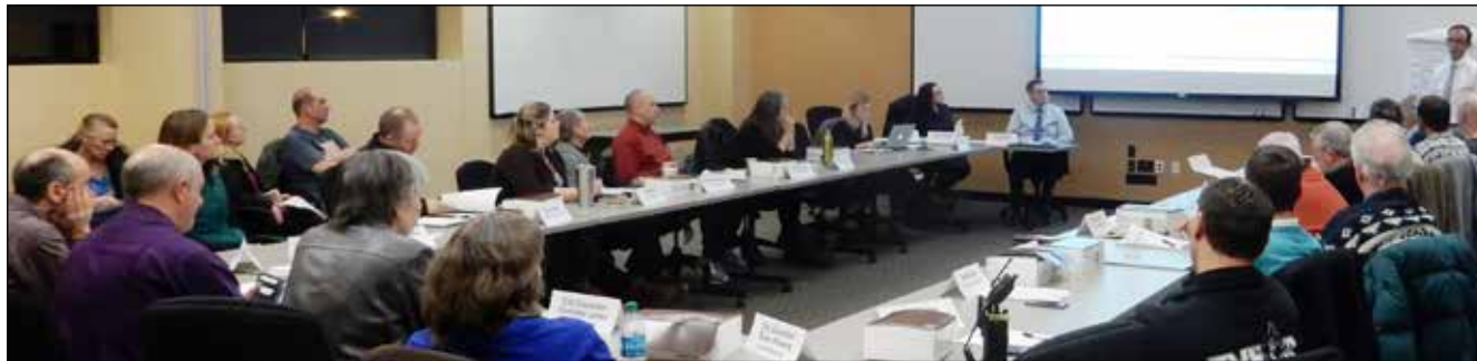
The French Prairie Bridge Project task force met for the first time in late January to begin work on the proposed bicycle/pedestrian/emergency-access crossing of the Willamette River west of the Interstate 5 Boone Bridge in Wilsonville.