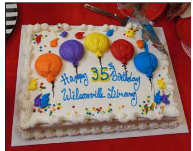
On Feb. 14, 2017 the Library celebrated 35 years of operation with a birthday party and cake for attendees.

During work session prior to the meeting, the City Council also heard a report and discussed the City's 2017 State Legislative Agenda for general public-policy priorities that guides how the City reacts to specific legislative proposals that may arise in the upcoming Oregon Legislative Assembly session that convened on Wednesday, Feb. 1, 2017.