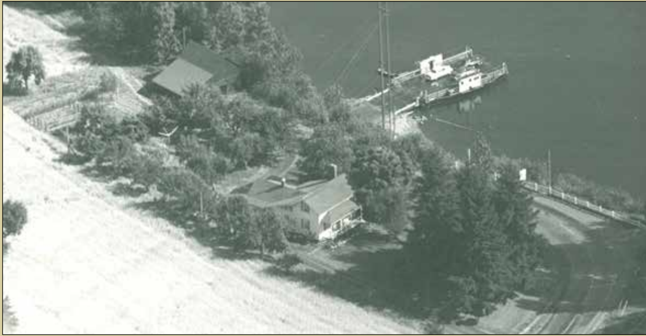
shows the Boones Ferry docked with three cars in Wilsonville on the north shore of Willamette River and in the center is the Tauchman House that is located today in Boones Ferry Park.