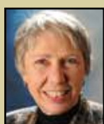
Charlotte Lehan City Councilor