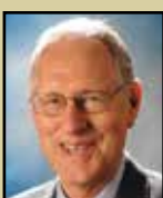
Tim Knapp Mayor

The City Council usually convenes on the first and third Monday of the month at City Hall, with work session generally starting at 5 pm and meeting at 7 pm. Meetings are broadcast live on Comcast/Xfinity Ch. 30 and Frontier Ch. 32 and are replayed periodically. Meetings are also available to stream live and by video-on-demand at www.ci.wilsonville.or.us/WilsonvilleTV . Public comment is welcome at City Council meetings.