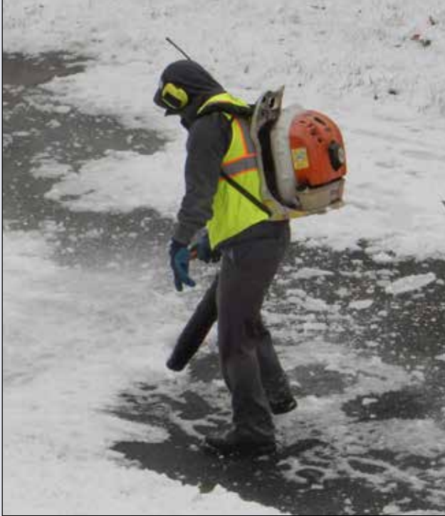
City staff clears snow from the sidewalk at City Hall.

City code requires all Wilsonville property owners to clear snow and ice from the sidewalks in front of and adjacent to the property they own. Unfortunately the majority of residents and businesses fail to do so and violate City code. The infraction also exposes the property owner to potential legal liability and damages if someone were to fall and injure themselves.