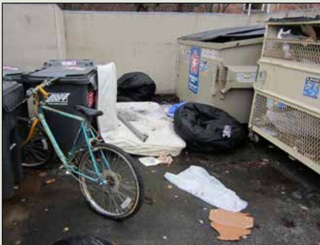
Bulky waste should not be placed near the recycling containers without approval from the property manager.

Many who call Wilsonville home opt to live in apartment or condominium communities, known as 'multifamily' dwellings. While there are many conveniences to living in multifamily communities, disposal of bulky waste, electronic waste and recycling is not always that easy.