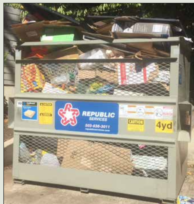
Cardboard should be broken down and flattened before being placed in the recycling bin to maximize space usage.

Before attempting to deposit bulky waste onsite, tenants should first check with their onsite property manager to understand the applicable rules and limitations. Often property management policies, billing restrictions and space limits, prohibit onsite disposal of bulky waste in multifamily communities. During recent site visits in Wilsonville programs staff found that approximately fifty percent of the apartment sites