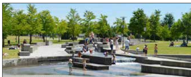
The plan's study area includes Town Center Park and the 100-acre area within and adjacent to Town Center Loop.