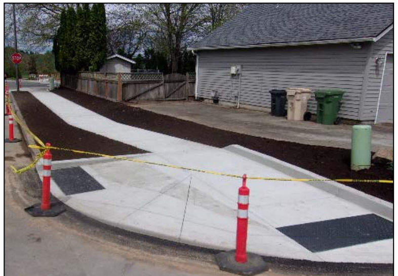
New sidewalk between Jamaica and Wilsonville Road across from Graham Oaks Nature Park.

Greetings! The Planning Division completed two major multi-year long-range planning initiatives this month with the City Council adoption of the Basalt Creek Comprehensive Plan and Transportation System Plan amendments, as well as the adoption of the forward thinking, visionary Town Center Plan. These significant community initiatives lay the groundwork for transformation of the community over the long-term, creating future opportunities for job creation, economic development, and a vibrant city center with year round place making. Both projects were identified as City Council goals. Staff is pleased to be able to finish these two important goals, as the Council goal setting retreat was also just held outlining the next two years of exciting initiatives.