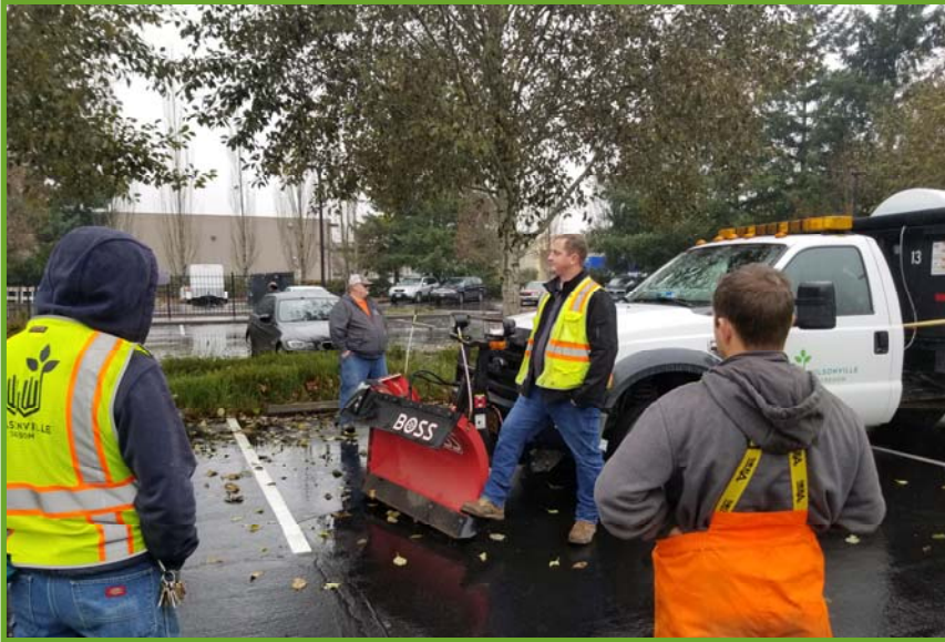
Detailing the operation of the snow blade on the front of the MgCl tank truck.