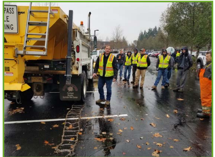
Demonstration of the installation of tire chains for large vehicles.