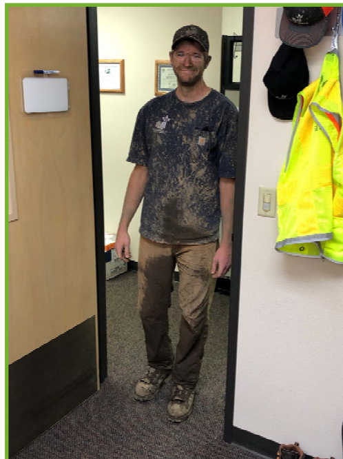
Some days are dirtier than others