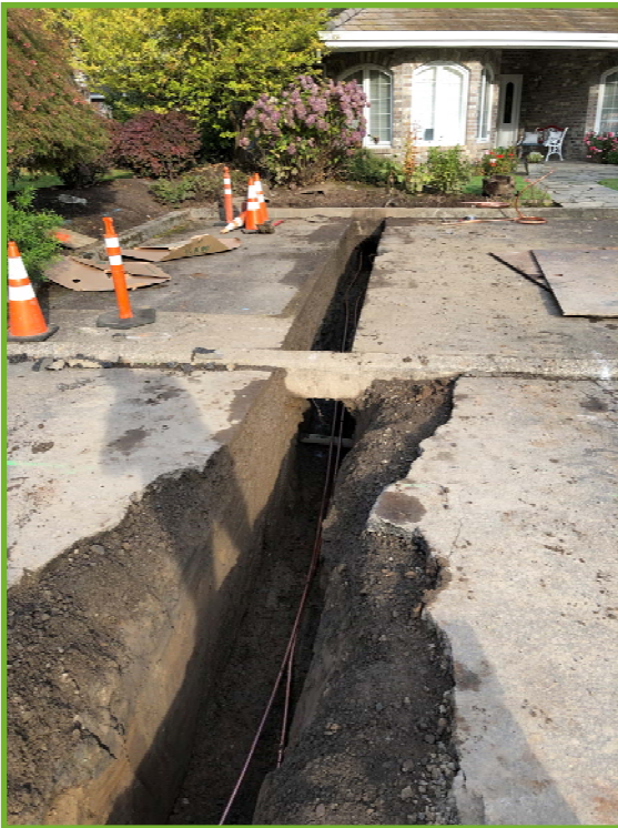
Trench for new water line

The water crew jumped on repairing the leaks immediately. The most significant leak was the 2" lateral in Village Greens Circle. The fix for this repair involved tapping the existing line and installing 2 new service lines which entailed excavating a trench to the water main and installing two new corporation valves as well as running new copper lines to the meters.