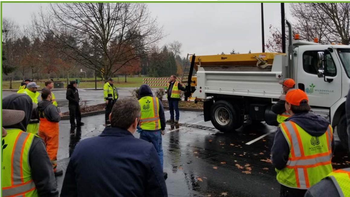
Discussing operation of the sanding equipment.